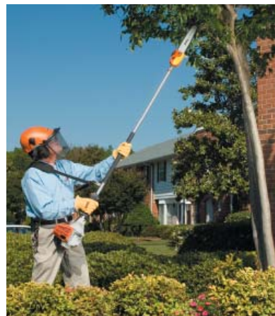
HT 130 fixed shaft pictured above

The HT 130 is equipped with a fixed length shaft, while the HT 131 features a telescoping shaft that can be adjusted to reach about 16'. This emissions compliant 4-MIX® engine offers the user more torque and power, as well as fuel efficiency.